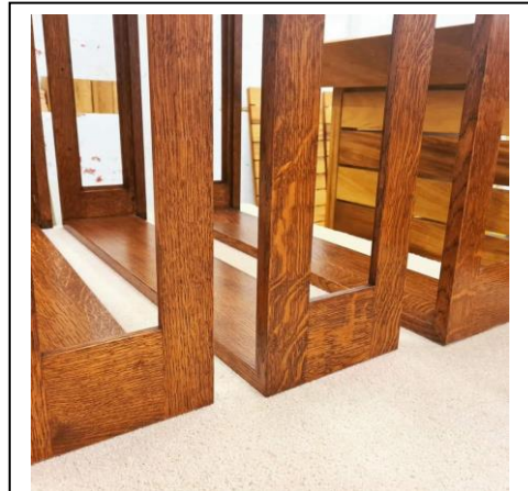
© Marc Davies – “Classic” Cabinet